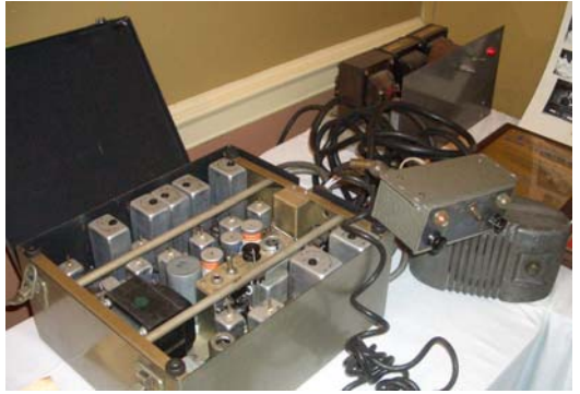
One of the original radios from the COLUMBIA EME Expedition from the archives at K3JJZ